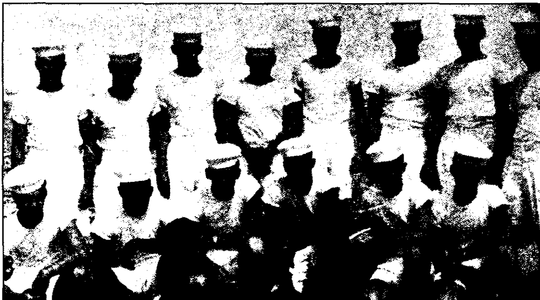
Photo of Boiler Tenders from 1956 Cruise Book.