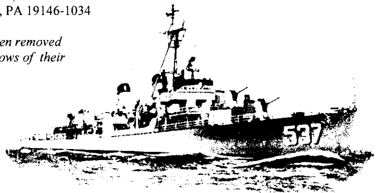
USS THE SULLIVANS DD 537