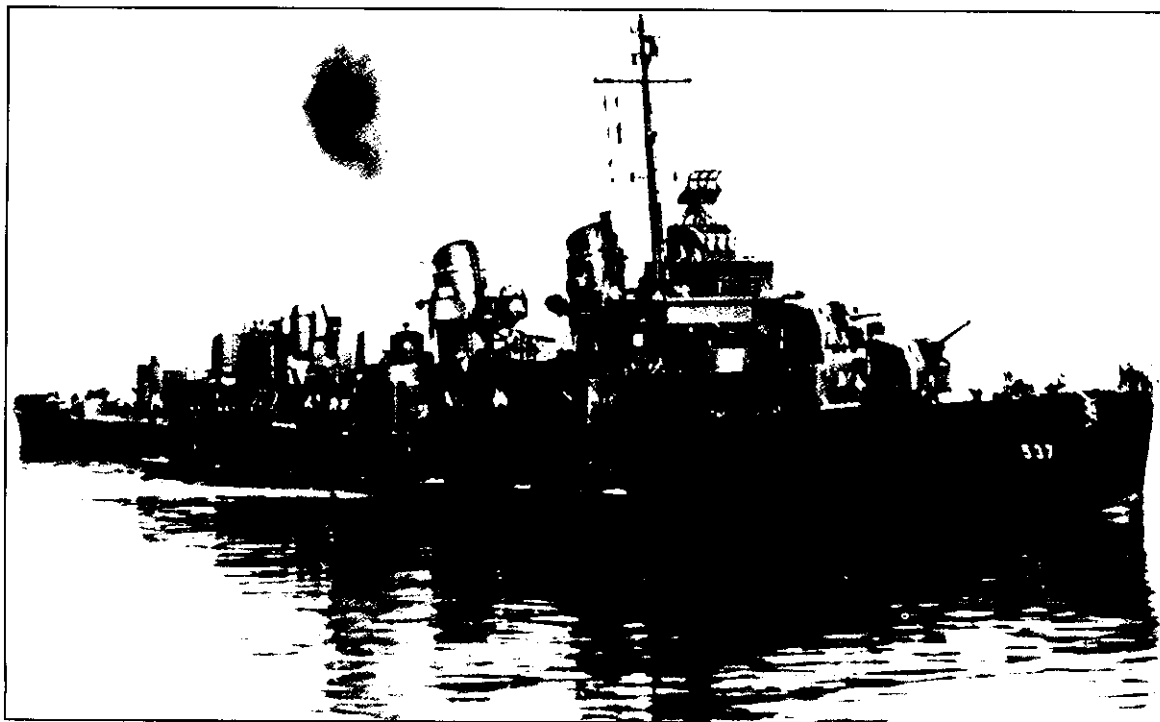
USS THE SULLIVANS DD 537 Somewhere in the Pacific during WWII.

NEEDED: DIFFERENT PHOTOS OF DD537. We try to have a different photo of both DD537 and DDG68 in each newsletter. We have exhausted our source of different scenes of DD537. If anyone has a photo that they haven't seen in print before we would appreciate knowing about it. Please send us a photocopy or a copy can be sent by the internet to rksdd537@mass.rr.com .