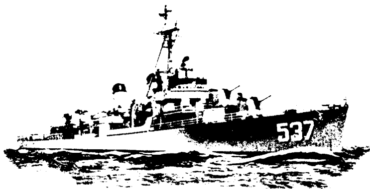
USS THE SULLIVANS DD 537